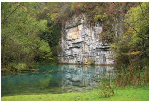
Plut D. et al., 2014. Regionalni viri Slovenije: Vodni viri Bele krajine (Water resources of Bela krajina), 15.

12.15–14.00: travel to Marindol, including an hour's walk to litter forests; long-term impacts of litter extraction, lasting for centuries, on soil characteristics, and, consequently, on species composition – and the question of recent vegetation changes in such light forests due to abandonment of litter-harvesting (Dr Žiga Zwitter)